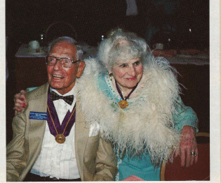
Eloquence and Grandeur Launch 1.F.S.E.A. Future 1901 ~ 1988